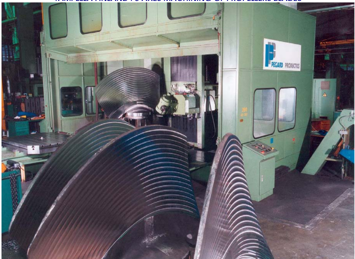
PRECIVIT WITH C100