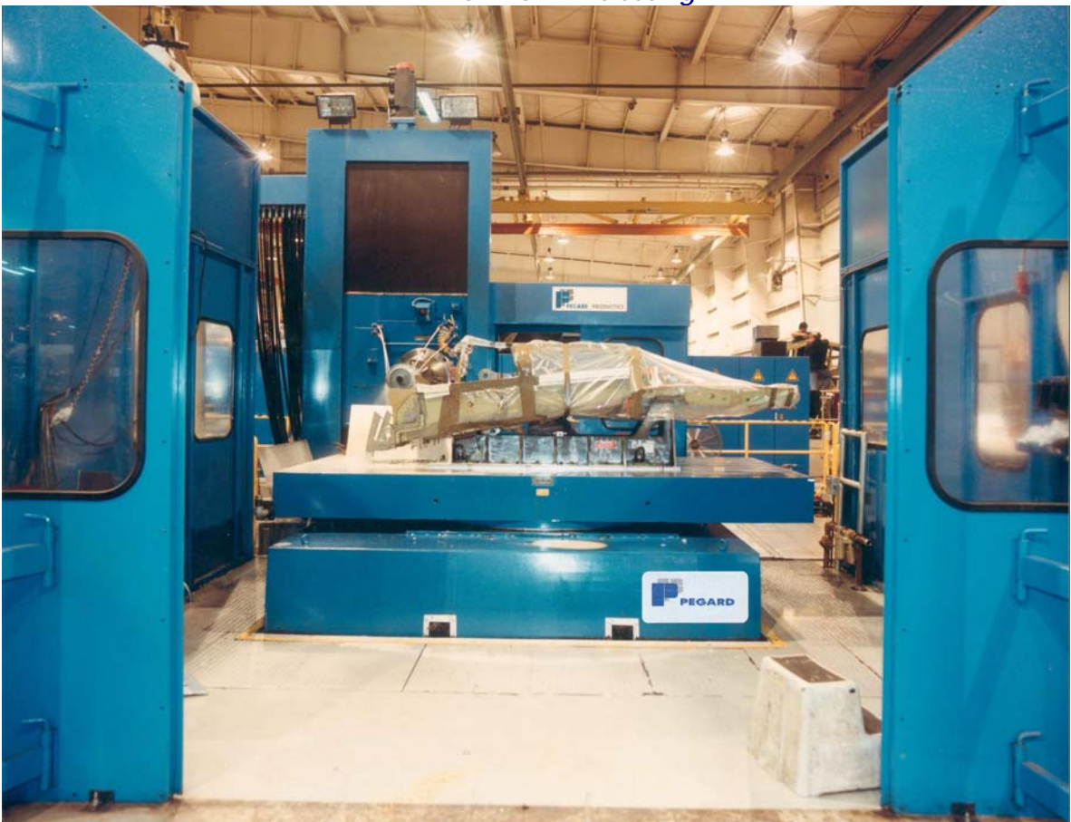
BOEING : PRECIVIT 2 (SUPPORT FOR TURBO REACTOR)