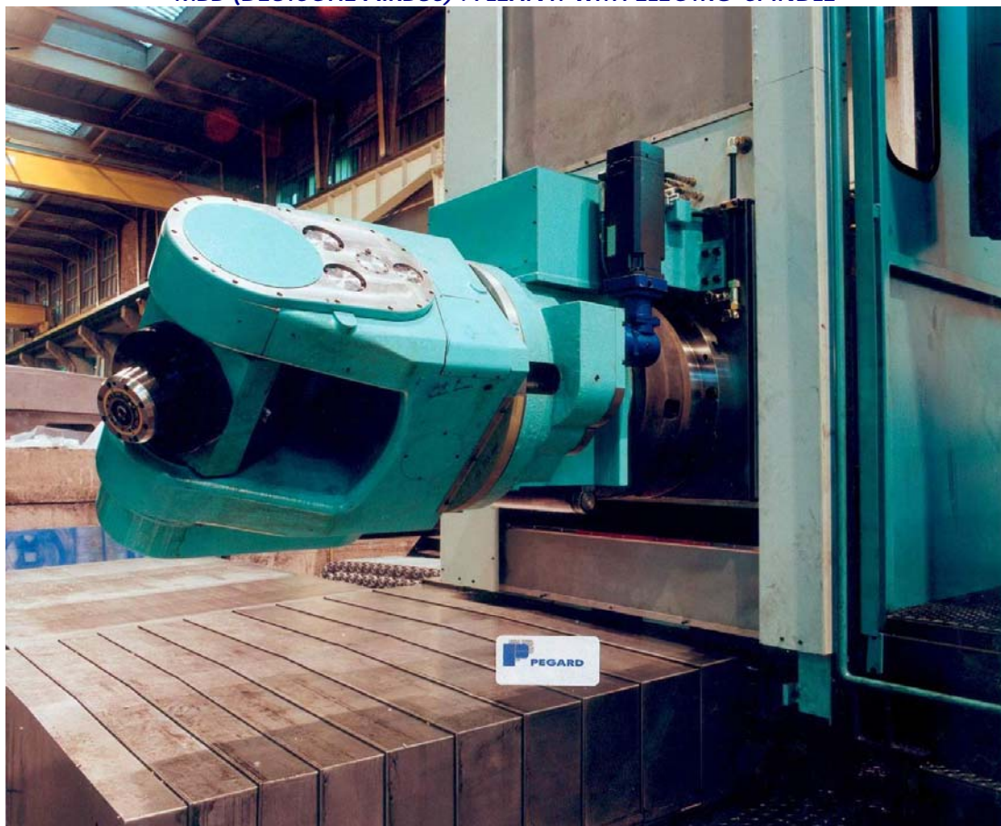
DEUTSCHE AIRBUS : PRECIVIT 2 WITH C5 (ELECTRO-SPINDLE HSK 63)