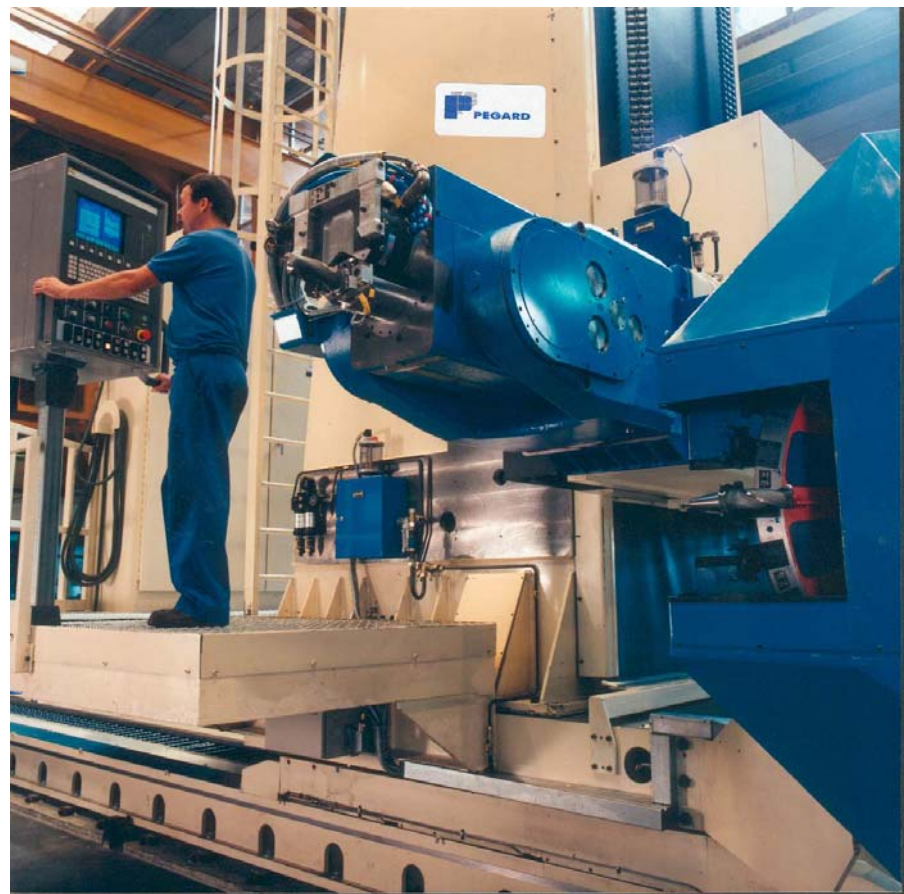
BOEING : AEROFLEX